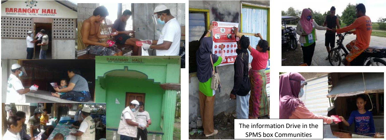
The information Drive in the SPMS box Communities